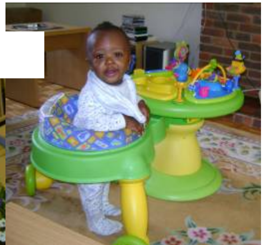
In a more relaxed mood, at home.