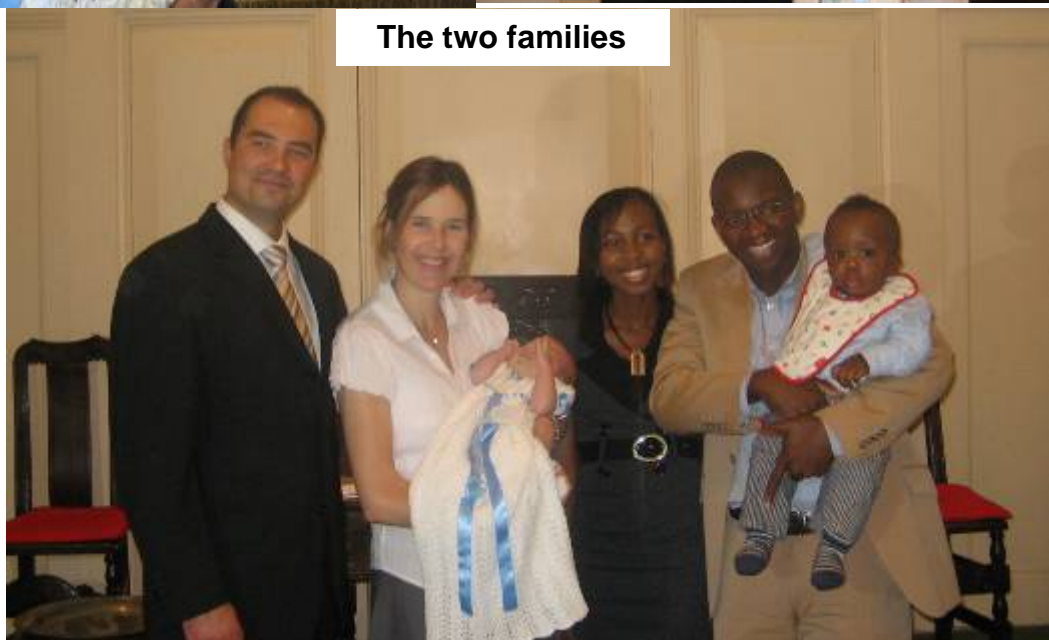
The two families